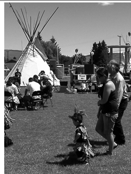
The littlest pow wow dancer Saturday was a perfect summer day for Conayt Friendship Society's National Aboriginal Day festivities. And Voght Park is a perfect new choice of location. A true start to summer!