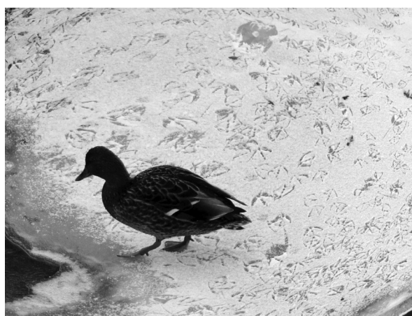
Tracks on Nicola River.

Tel.: 250-378-3734 • 2675 Garcia St., Merritt