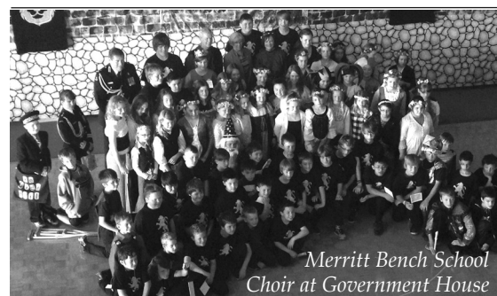
Merritt Bench School Choir at Government House

VICTORIA DAY WEEKEND EDITION – MAY 15, 2015 #2724 News, opinion, community events & classifieds since 1996! Box 2199 Merritt, BC V1K 1B8 T (250)378-5717 F (250)378-2025 market@uniserve.com merrittmorningmarket.wordpress.com