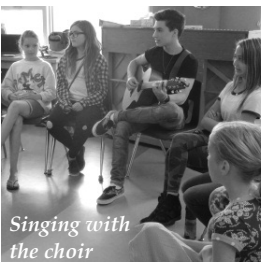
Singing with the choir

News, opinion, community events & classifieds since 1996! Box 2199 Merritt, BC V1K 1B8 T (250)378-5717 F (250)378-2025 market@uniserve.com merrittmorningmarket.wordpress.com