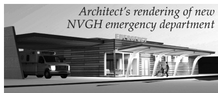
Architect's rendering of new NVGH emergency department

The update will increase the dedicated department space to approx. 5,380 sq. ft., up from the current 1,076 sq. ft., and will improve patient confidentiality, allow for direct sightlines to patients, and enhance staff safety. It will include: a covered ambulance bay with dedicated ambulance entrance; confidential triage and registration spaces; expanded trauma and treatment areas, with emphasis on increased privacy and better infection control measures; and a new nurse station, medication room, washrooms and equipment storage.