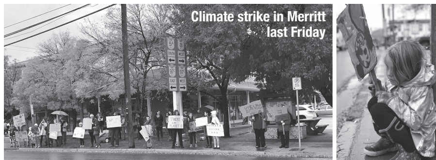
Climate strike in Merritt last Friday

INT'L TRANSLATION DAY EDITION — SEPT. 30, 2019 #3334 News, opinion, community events since 1996! Box 2199, Merritt, BC V1K 1B8 Tel: (250) 378-5717 Fax: (250) 378-2025 Email: market@uniserve.com