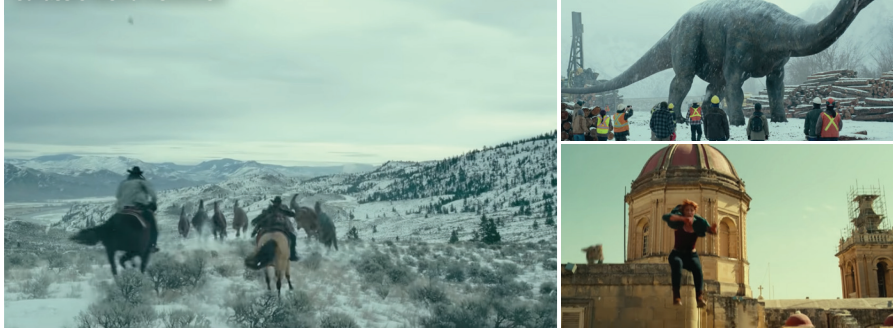
Jurassic World Dominion

Jurassic World Dominion The trailer for Jurassic World Dominion officially dropped yesterday, with a full-minute of footage shot in BC. The film, starring Chris Pratt and Bryce Dallas Howard, began production on Feb. 24, 2020 in the Kamloops and Merritt areas — under the working title “Arcadia” — and ran through to March 6. Other locations in Merritt, such as the old Ardew site, were also used: beyond shooting in Big Box Canyon, production crews were spotted around the historic Coldwater Hotel and Ponderosa Sports store across the street.