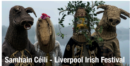
Samhain C il  - Liverpool Irish Festival

Most American Halloween traditions were inherited from Irish and Scottish immigrants. Folklorists have used the name 'Samhain' to refer to Gaelic 'Halloween' customs until the 19th century.