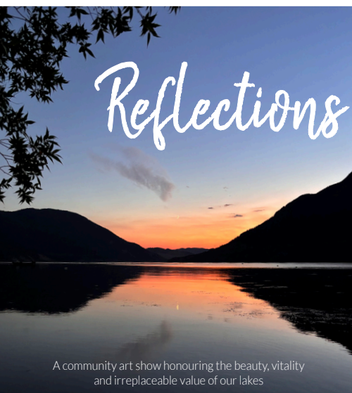
A community art show honouring the beauty, vitality and irreplaceable value of our lakes

Follow the link: https://employment.cna-trust.ca/job-postings_join_our_team.htm